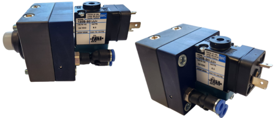
UMS-131938-COMPACT Blow, Preblow, Recovery