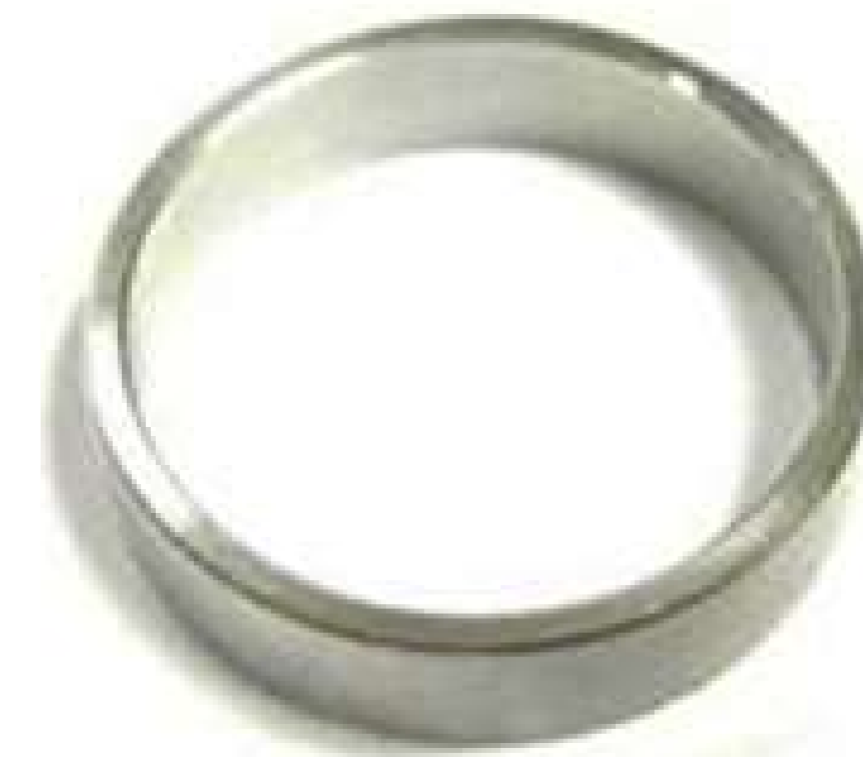
Collar, roller shaft pin UML-20D10A7849C