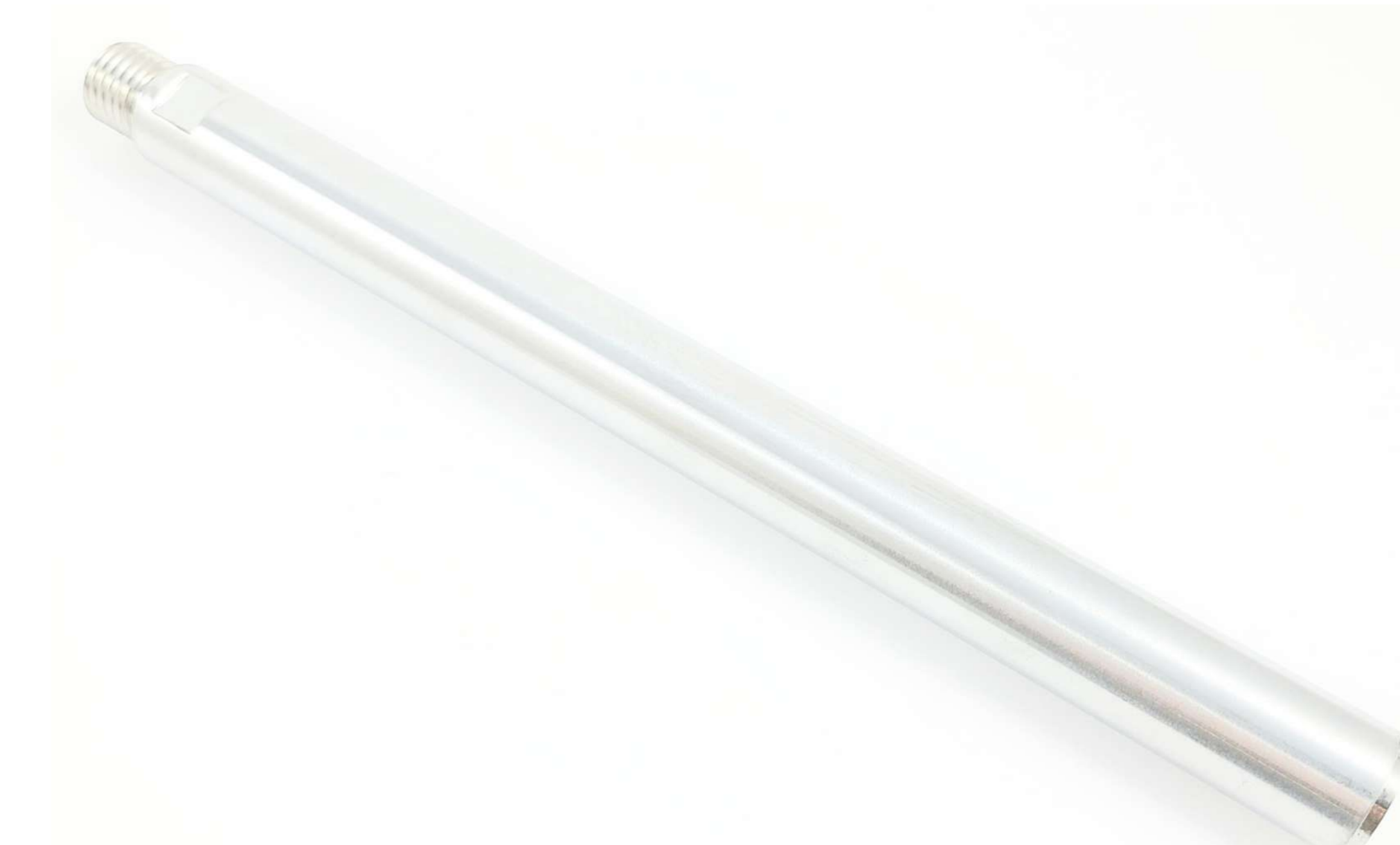
Shaft lift (235 mm) UML-20B2DTR07