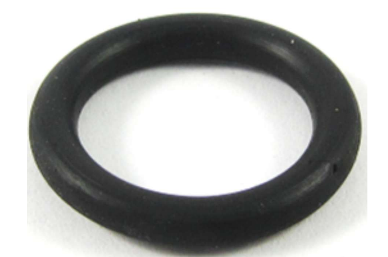
O-ring stem UML-20A0021V