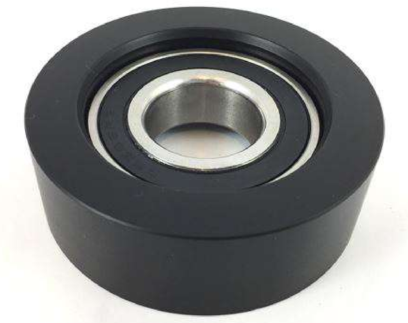
Cam wheel ass'y UML-20D10A2749H