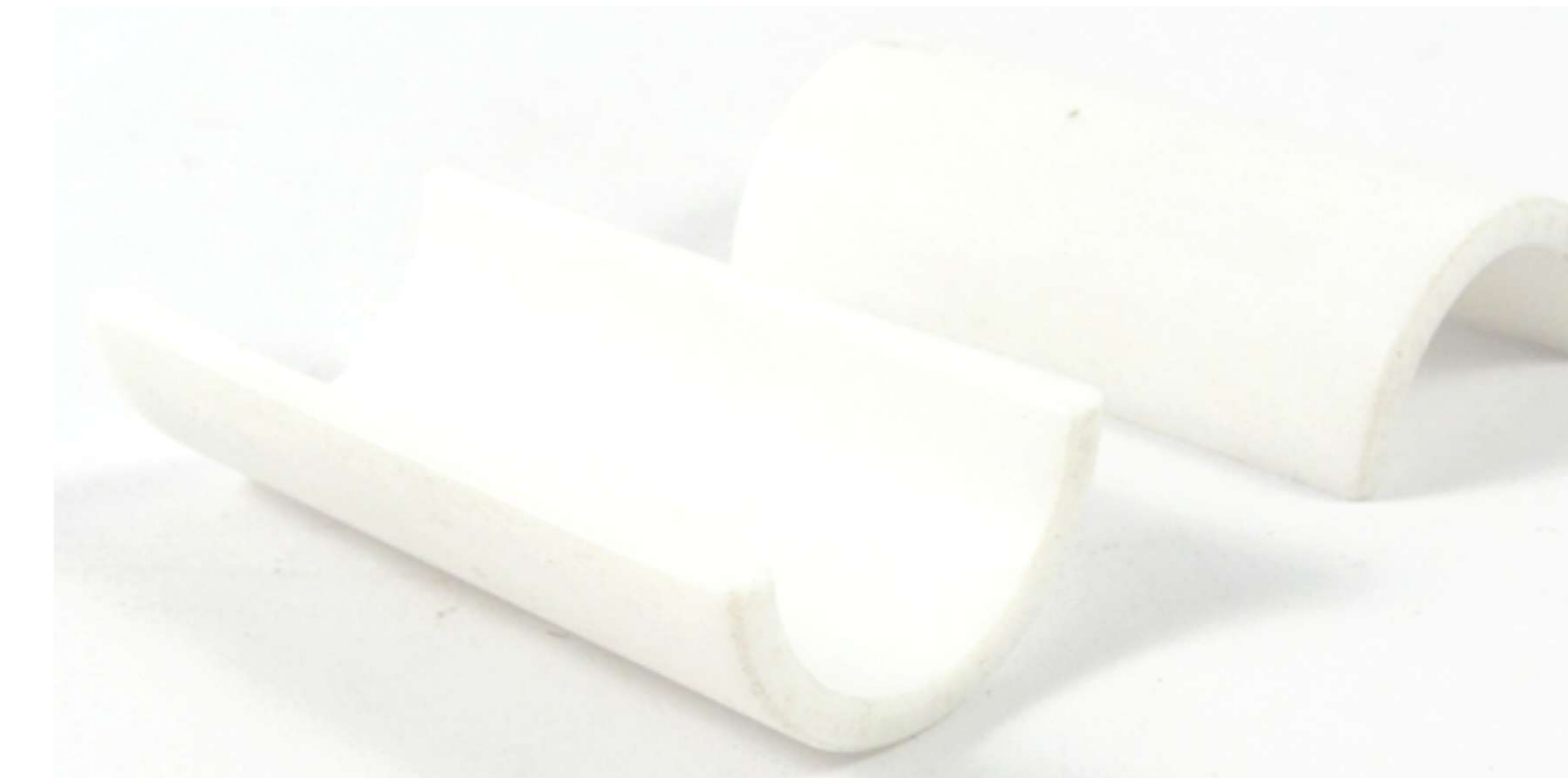
Bushing/valve (pair) UML-20A0015