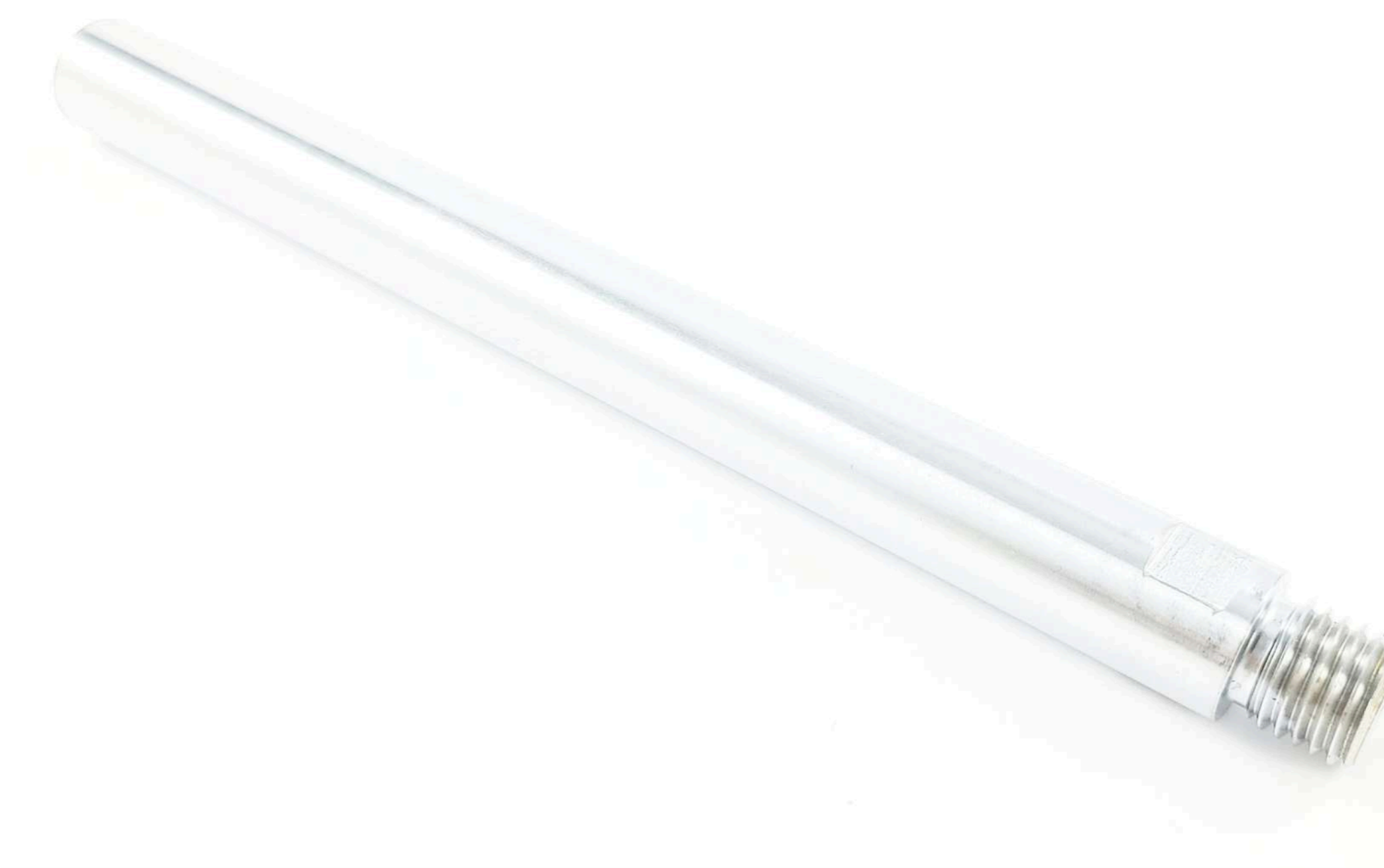
Filler shaft UML-20D10A12