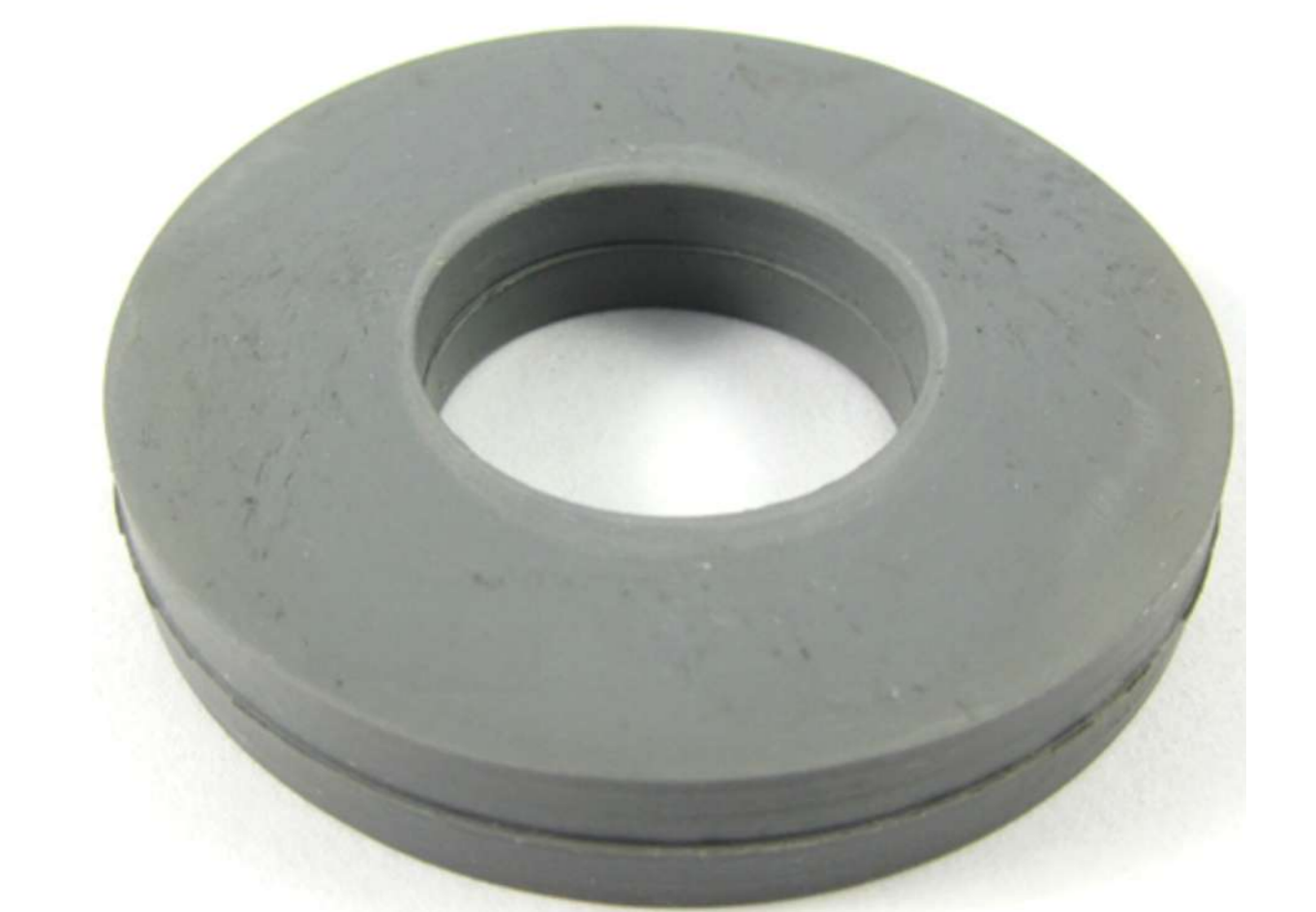
Bumper seal UML-20A0020V