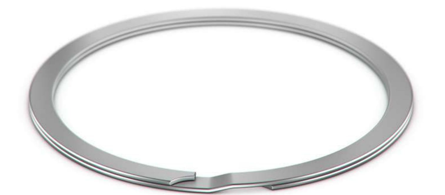
Ring retainer UML-20D10A13