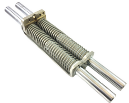
0104-001-01-01 Improved Trolley Girondine