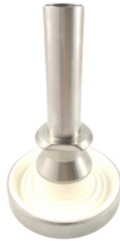
UMS-04253247102 Filler Membrane 18 mm