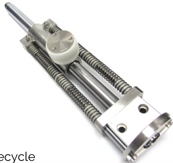
0489-001-01-01 Improved Sasib Filler Trolley ass'y