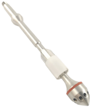
UMS-8DCVG0003130 Vent Tube