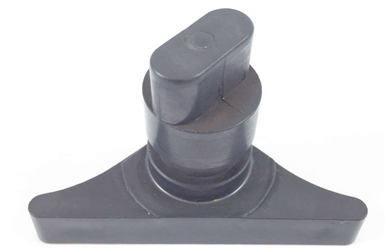
Axle/shaft right UMKN-1070250771