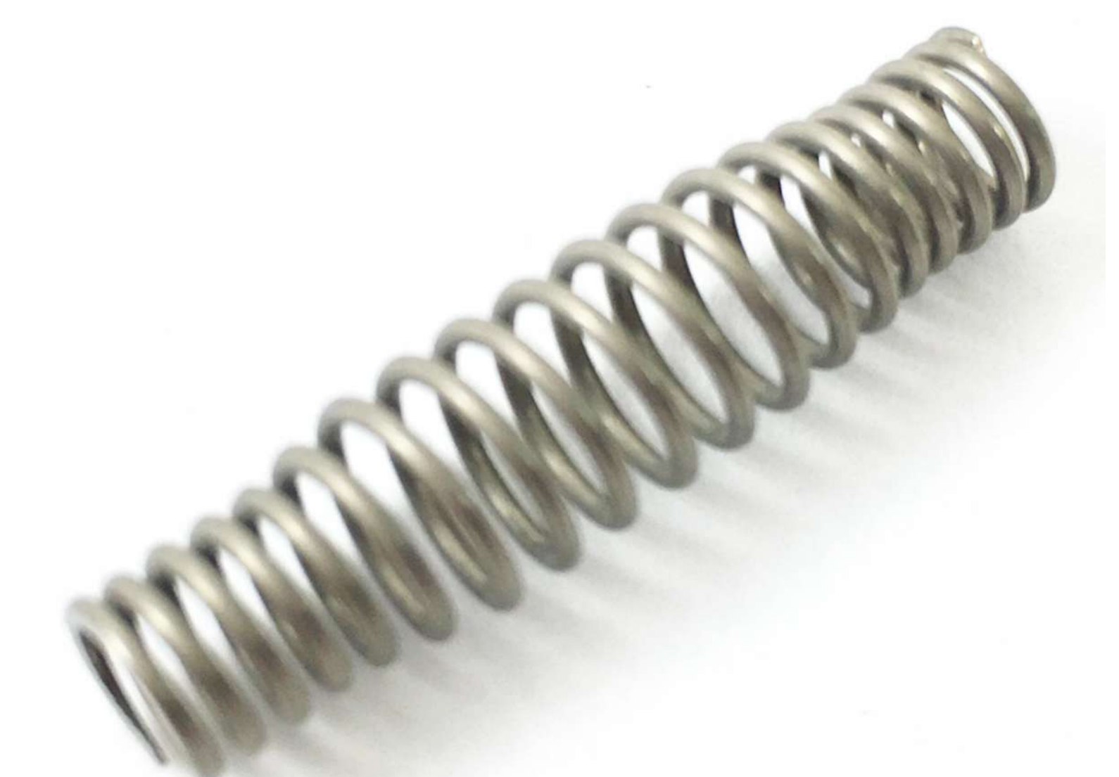
Spring for filler gripper UMKN-0900785507