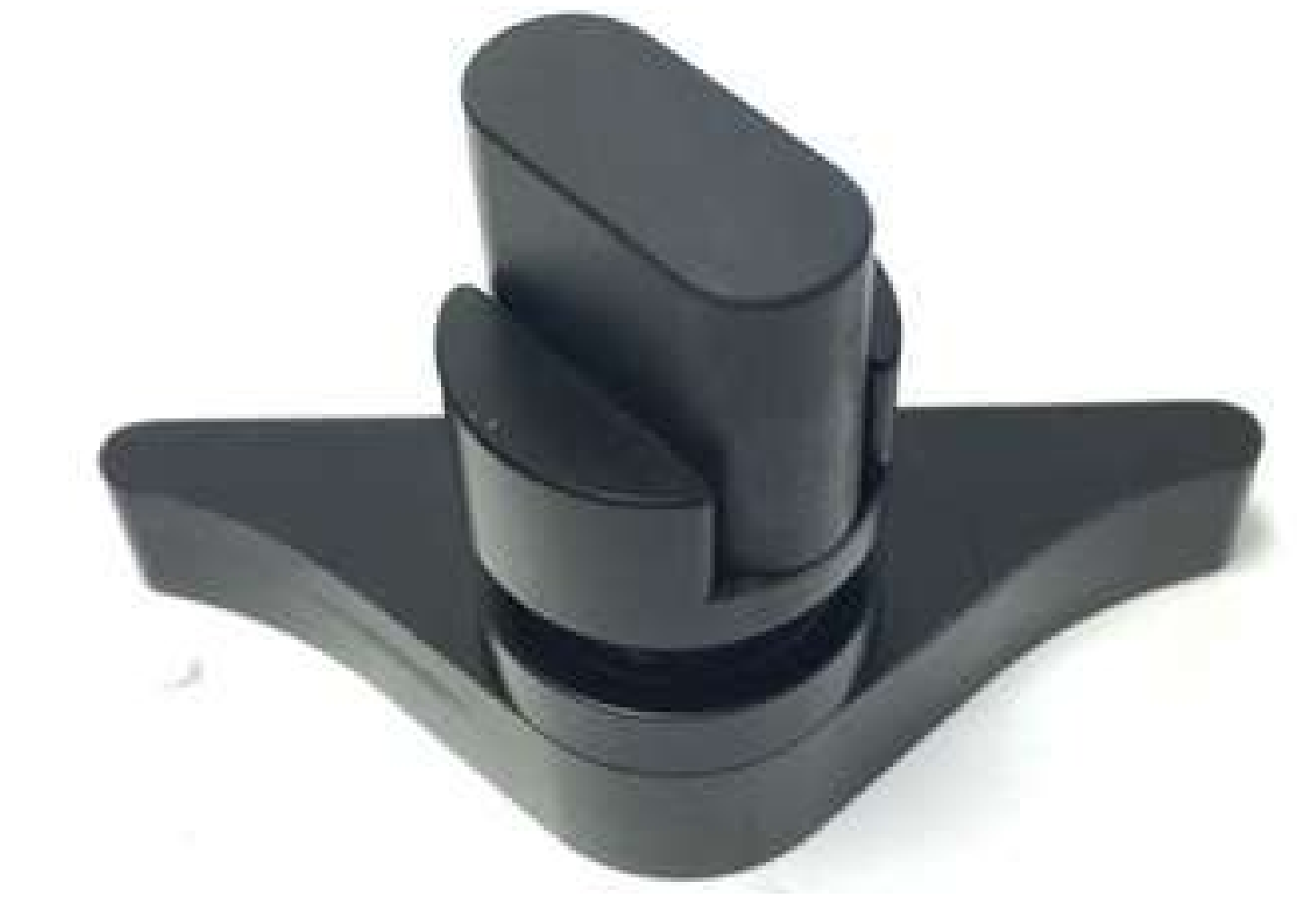
Axle/shaft left UMKN-1070250761