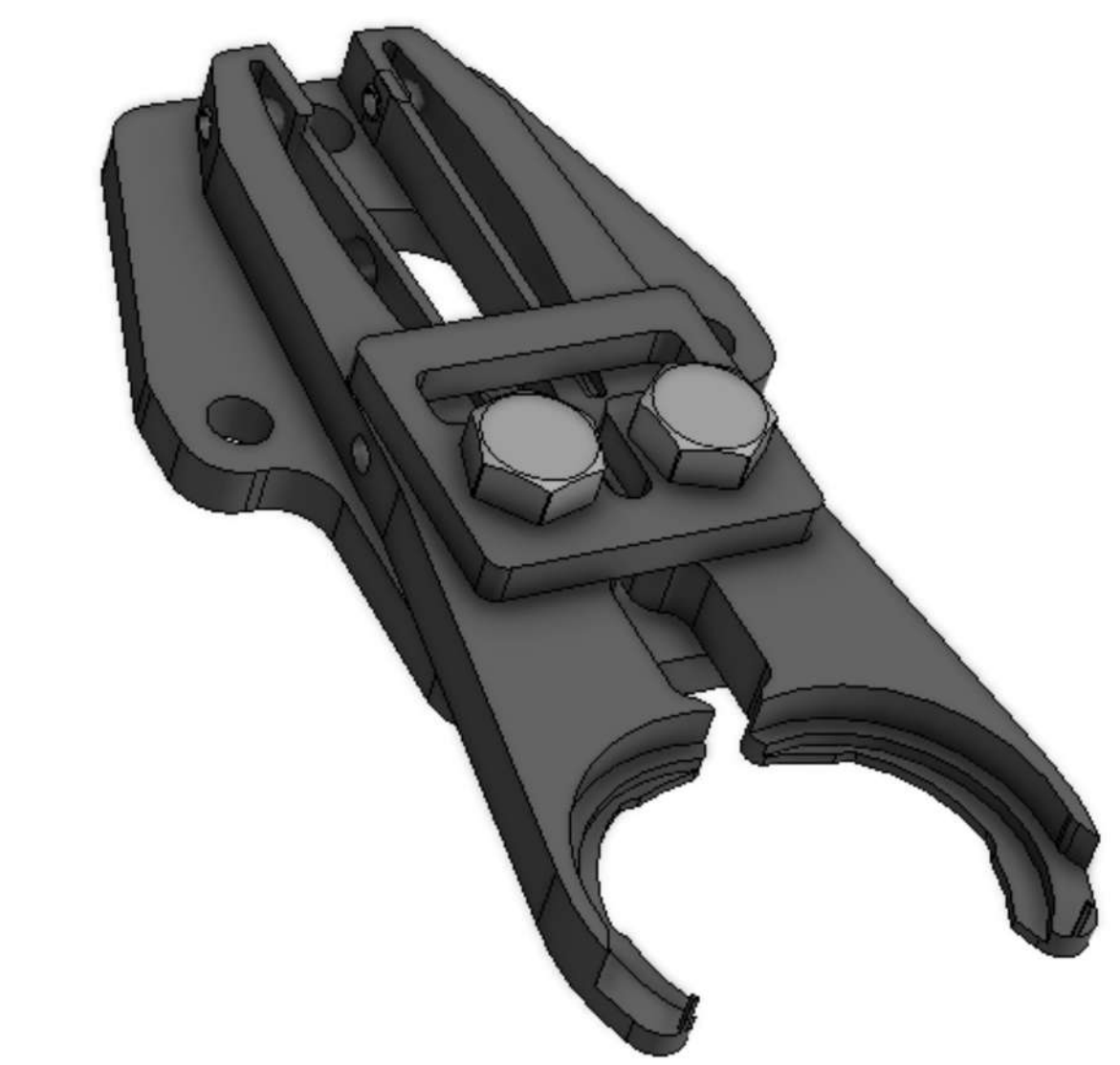
Transfer grippers ass'y 0099-009-01-11